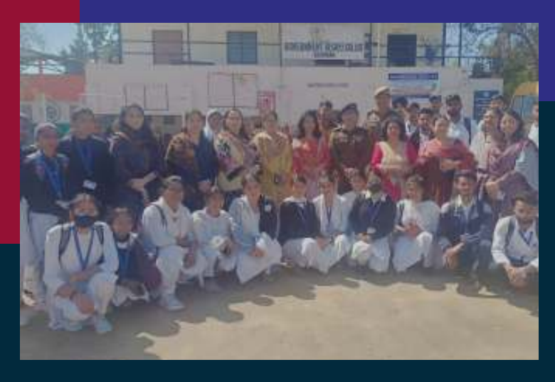
Awareness program conducted on the introduction of new criminal laws, in collaboration with J& K Police.